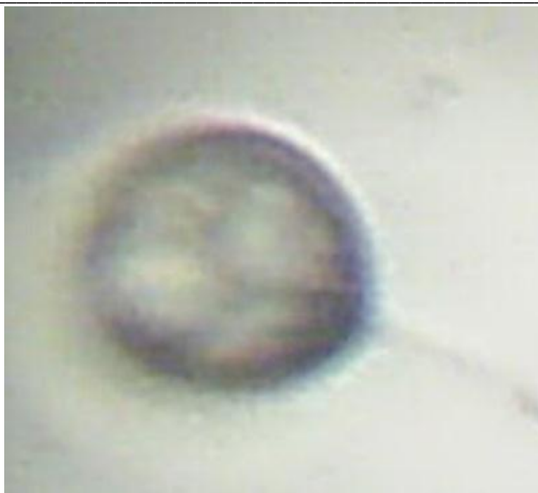
Fig. 2. Recovered embryo with four cells X400.