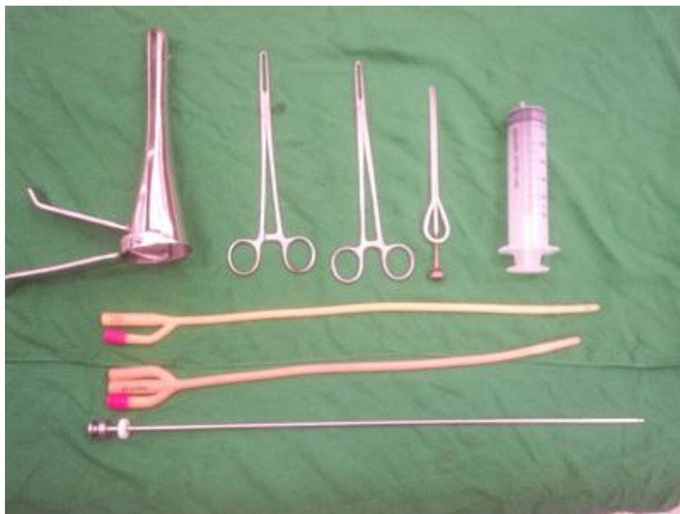
Fig. 4. Instruments used for transcervical technique of embryo recovery in ewes.