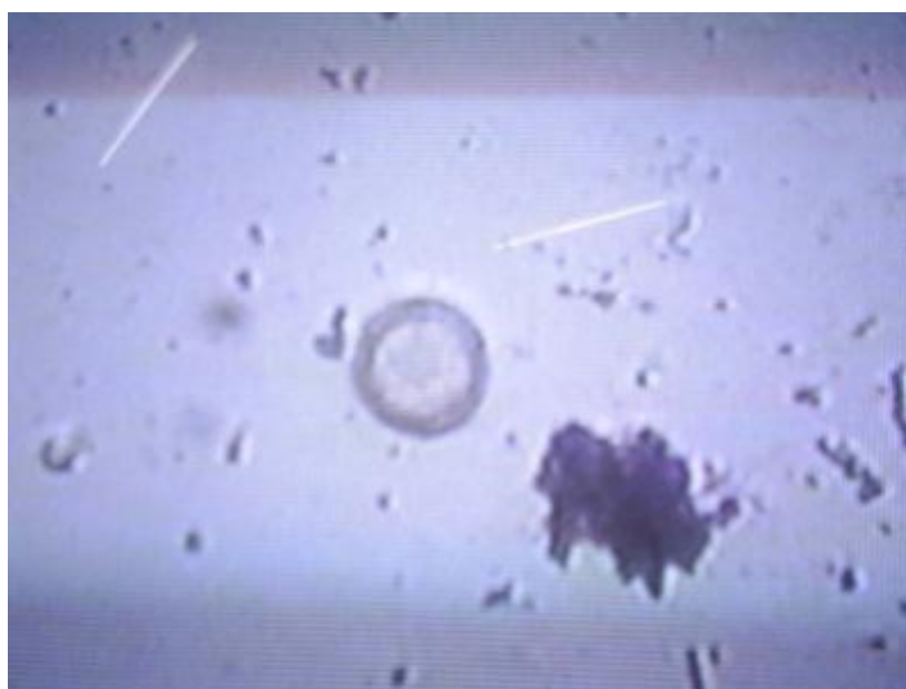
Fig. 1. Unfertilized ovum X400.