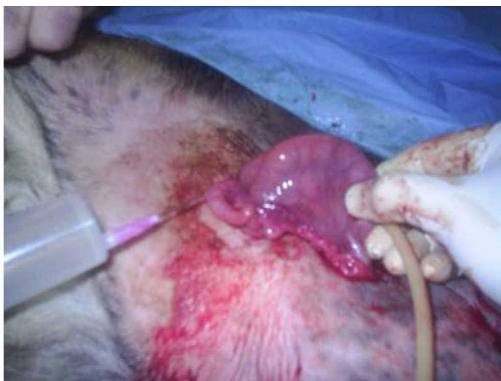
Fig. 3. Embryos were recovered using semi-laparoscopic technique in ewes.