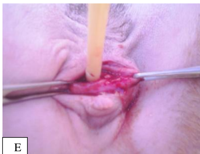
Fig. 5. The transcervical technique, A- Immobilization of ewes in a standing position, B- A lubricated speculum inserted into the vagina, C- The external os of the cervix was grasped with the Allis forceps and pulled to vulval opening, D- A bovine testis dilator introduced into cervical canal and gradually dilated in order to dilate and open the cervical canal with a help of screw provided with the instrument, E- A three-way Foley catheter was introduced, and gentle probing and twisting motion passed the cervical canal with the aid of a stylet.