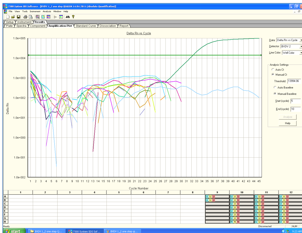
Fig.(1): negative results to BVDV type 2, green curved line represent positive control to BVDV2