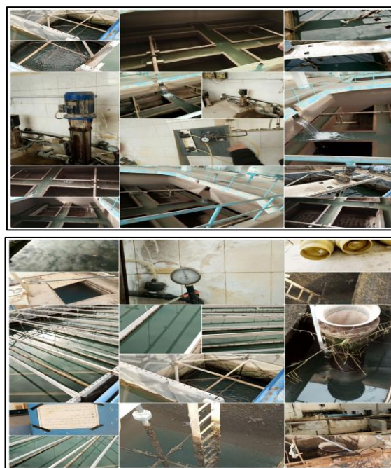
Figure 2. Pictures explain the steps for removing heavy metals from wastewater in the water purification center in Karbala city.

now separated from the water, are transferred to the collection basins, ensuring the cleanliness and safety of water for human use. Following the sedimentation process [33], the water is sent to the purification stage using filters, which can help remove unwanted elements and impurities. The water is then transferred to the filters through tubes [34,35]. Each filter features a set of legs spread throughout the basin, and its shape is a large basin below it. The filters help remove various elements and impurities from the water. After stopping work at night, the filters are washed. They are ready to work the following day once the water has been pumped from the bottom. Chlorine is then added to water in order to treat the contaminants. This process is carried out using a pressure-dispersion method [36]. The membrane is then removed through this process, and a portion of chlorine is pumped for increasing its sterilization. This process then prepares the product for human use. In long distances, chlorine's concentration decreases, and its aroma sometimes disappears from water [37]. A particular type of basin is made to deal with defective or perforated gas bottles that contain chlorine. This substance can be harmful if ingested or inhaled., and it can cause severe respiratory damage if its concentration exceeds a certain level, Figure 2. [38]