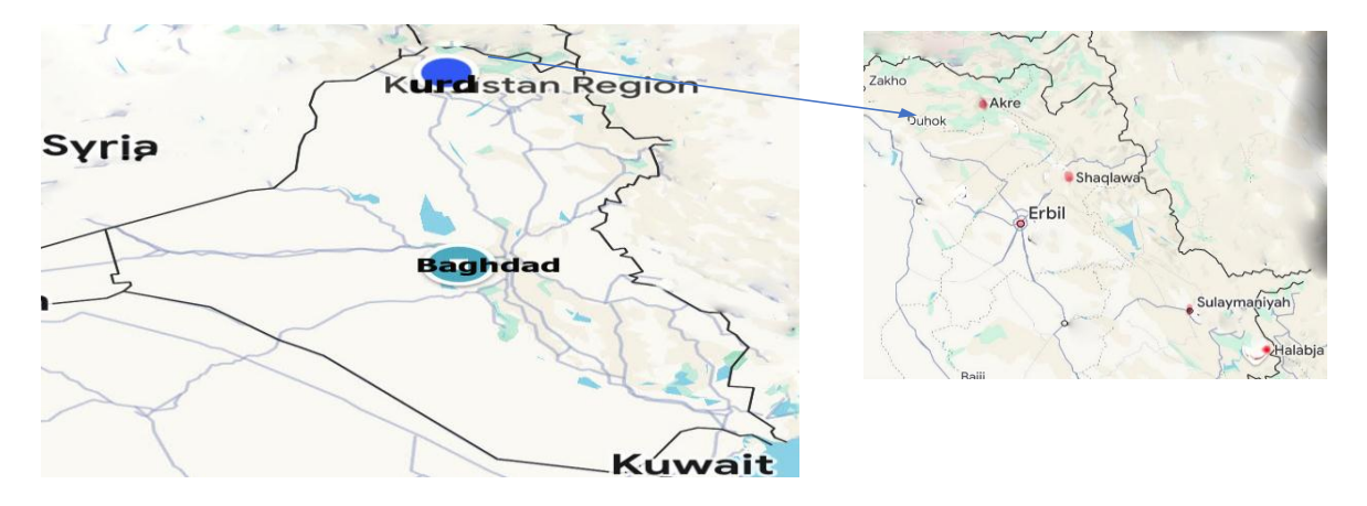
Figure 1. Geographic Distribution of Pear Landraces in the Kurdistan Region of Iraq