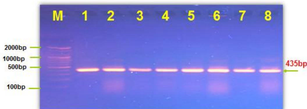
Figure 2: Agarose gel electrophoresis image that show the PCR product analysis of hlyA gene in Escherichia coli . Where M: marker (2000-100bp), lane (1-8) some of positive Escherichia coli at (435bp) hlyA gene PCR product.

The pore-forming hemolysin ( hlyA ) of E. coli represents a unique class of toxins that require a posttranslational modification for activity, specifically the covalent amide linkage of fatty acids to internal lysine residues; produce a catalytic a fragment acting in the eukaryotic target cell (25).