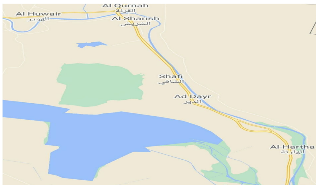
Fig. 1. Northern Basrah Governorate, the figure represents the places where samples were taken from.

Table 1, which is collected from several regions of Northern Basrah Governorate, South Iraq, presents the findings of the current study on Uranium