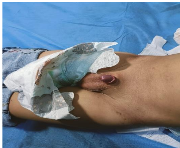
Figure 5: circumcision directly after the operation.