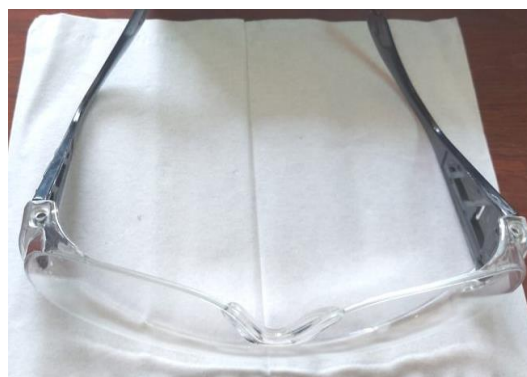
Figure 3: protective goggles used by surgeon and staff.

Figure 3 shows the protective goggles used by surgeon and staff