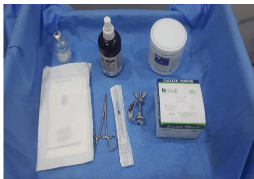
Figure 2: Equipment.

The following items are arranged on a tray with drapes as shown in Figure 2-2. Surgical mosquito, gauze, gloves, syringes (insulin syringe), Winkelman circumcision clamp, lidocaine injection 2 %, EMLA ointment, povidone iodine solution 10 %.