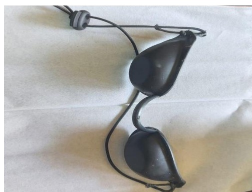
Figure 4: protective goggles use by patients.

Figure 4 shows the protective goggles used by patients