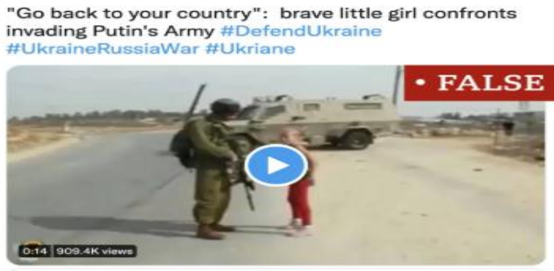
Figure 1: An article from BBC News discussing misinformation and false information circulating online. (BBC News, 2022).

Instances such as this emphasize the pressing requirement for AI-powered detection systems to recognize and address deceptive content that incorporates text, images, and videos.