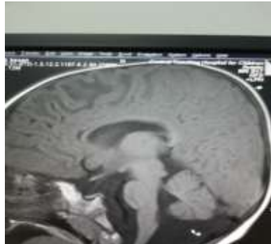
Fig 5: Saggital T1 wt. image showing moderate cystic dilatation of the posterior fossa communicating with the 4 th ventricle.