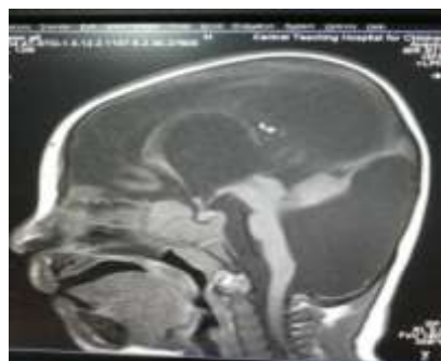
Figure 6: Show Dandy- Walker malformation with cystic dilatation of post. Fossa, hydrocephalus and vermian dysgenesis.