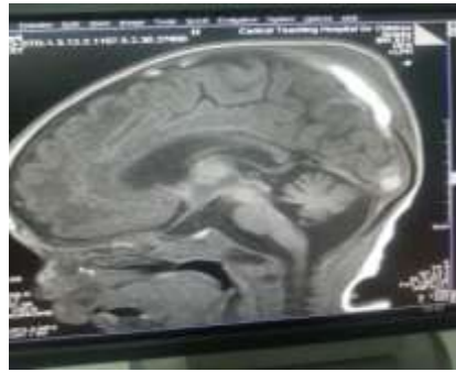
Fig 3: Saggital wt. image showing hypoplastic cerebellum, associated traumatic occipital hematoma in 3 years old male presented with ataxia