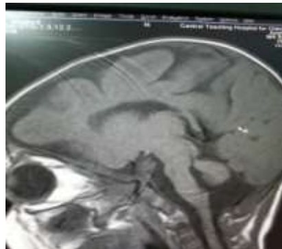
Figure 4: Show saggital spine Echo T1 weight image, of 5 months old boy with cerebellar dysgenesis.