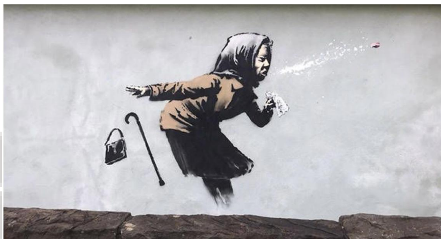
Figure (7) published by Banksy ,14/December /2020

On December 14, 2020, the anonymous British artist Banksy posted a mural on Instagram titled "Achoo," one of his most famous works that emerged during the quarantine period. As usual, Banksy captures an ordinary moment and amplifies it in a striking artistic style, making us rethink our societal