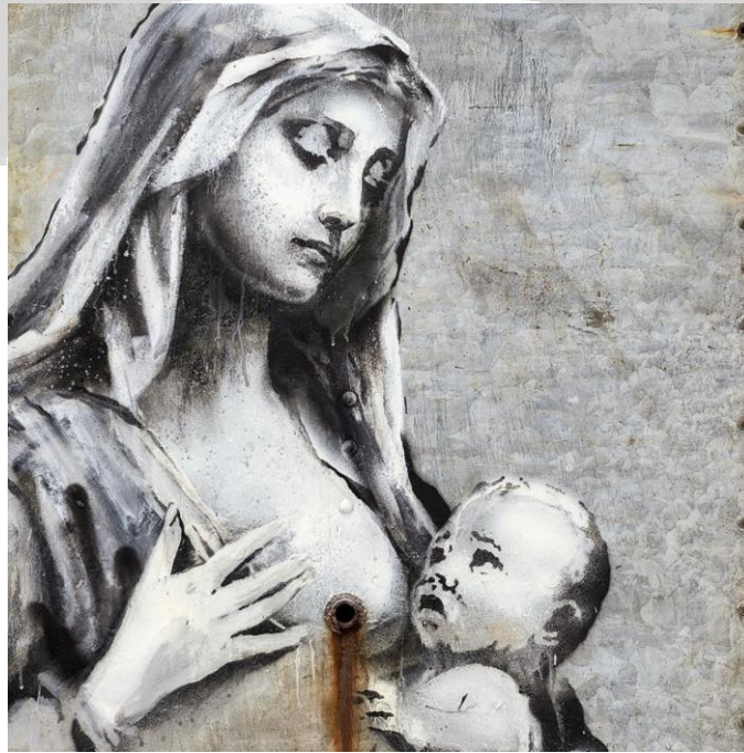
Figure (3) published by Banksy ,20/December /2024

On December 20, 2024, Banksy posted an image on Instagram depicting a mysterious artwork of Virgin Mary breastfeeding Christ Child. The image's pictorial meaning is embodied through two main dimensions: narrative and conceptual. The narrative process involves Virgin Mary (the main participant) and the Christ the Child she is breastfeeding (the target). The conceptual approach of this artwork prioritizes the expression of ideas through the interplay of typological and symbolic aspects.