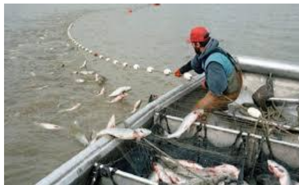
Figure 6. Fish caught by net