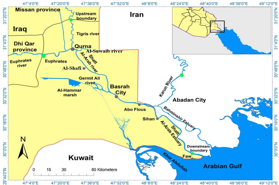
Figure 1. Map of Shatt Al-Arab River showing position of water supply from Tigris, Euphratis, Al-Suwaib, Al-Shafi, Garmatt Ali and Al-Karun rivers as well as Shatt Al-Arab River tributaries.