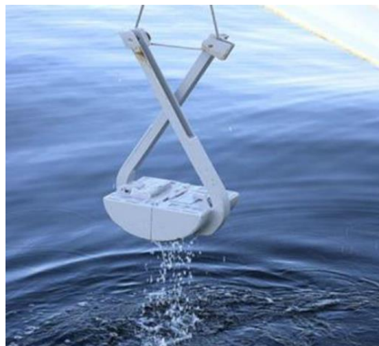
Figure 4. van veen Grab sampler for collecting sediments