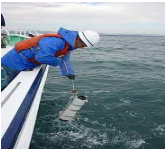
Figure 3. Water sampler for Collecting water samples

Assorted fishes as commonly available in Shatt Al-Arab Waters were collected from the river by means of net (Fig. 6), kept in ice box and transferred to the lab in marine science center/Basra University, stored frozen prior to analysis. In the lab fishes were thawed, cleaned, and muscles were cut from the side, Muscle samples were freeze dried. then sample was ground, and a certain amount was packed in a thimble (Whitman) and desiccated overnight prior to extraction. The desiccated thimble was loaded in a Soxhlet apparatus and extracted with Methanol: Benzene for 24 hrs. according to the methods described by Al-Ali et al. (2016). The solvent was reduced and TPHs was estimated by UV Fluorescence, using Basrah crude oil as standard. Spectra and calibration curve is shown in Figure (5). Quantification was performed at 310 and 360 nm as excitation and emission wavelengths respectively (Al-Ali et al. , 2016).