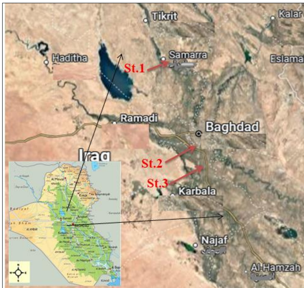
Figure 1. The study area at three sites from the Tigris River: two sites within Baghdad City and one site within the borders of Salah al-Din governorate with geolocation device 52 .