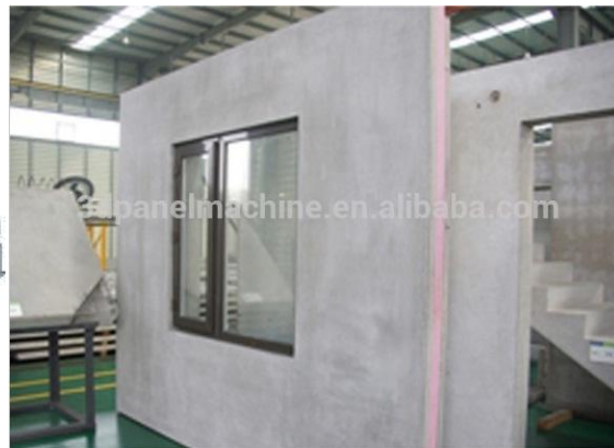
Figure 2: Wall