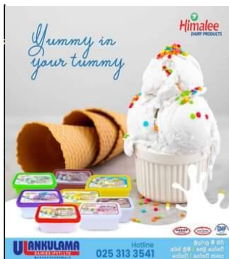
Figure 9. https://m.facebook.com/photo.php?

Lots of people love ice cream, especially kids. The ice cream balls appear in the graphic advertisements always cohesive and fixed in place, contrary to what is known about this dessert, which melts. The colors of the balls mix with each other smoothly. The reason is that what appears in the ad is colored mashed potatoes that are cohesive and do not melt.