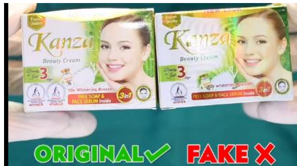
Figure 5. https://web.facebook.com/ListerineME

For instance, consumers may encounter advertisements for soaps, shampoos, or other cleansing products that highlight claims of extraordinary quality and effectiveness through phrases such as “healthy, natural, and dynamic,” “for hair so healthy it shines,” “silky touch, irresistibly smooth,” “go from flat to fluffy,” “no dandruff—just fabulous hair,” “where your beauty breathes,” and “watch the dryness disappear.” These expressions are often accompanied by visually appealing actors, actresses, or young models with exceptionally healthy and glossy hair. Such representations encourage consumers to believe that using the advertised product will make their hair softer, stronger, and more vibrant, and may even restore the vitality of hair follicles.