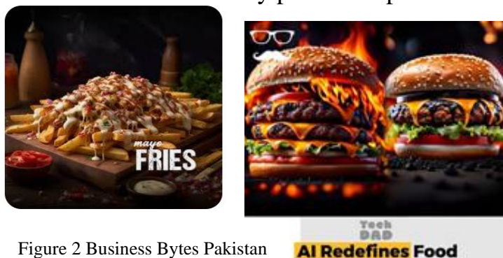
Figure 2 Business Bytes Pakistan

Advertising increases the spread of nearly identical food products such as burger and chicken that contain various substances that are generally unhealthy. It is high in sugar, salt, saturated fats, and many processed preservatives.