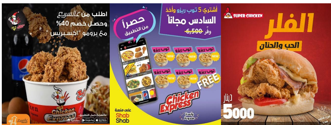
Figure 3. https://da-dk.facebook.com/pages/category/Restaurant/Chicken-express-iraq-573545509446936/

As shown in figure 2, it also lacks some beneficial nutrients. For example, the burgers and the chicken ads appear in the following ads as being large in size, beautiful and prominent ingredients. It seems to the clients that they will get the same burger when they buy it, but it is otherwise. In the ads, the burger is depicted undercooked to look beautiful, which opens the appetite and encourages its purchase. Chicken pieces appear in advertisements as beautiful, cooked and crunchy so as to make the clients buy them. The grilled chicken is stuffed with paper towels to make it look fatter. Cotton pads moistened with hot water are also placed behind the dishes to get the appearance of a rising steam.