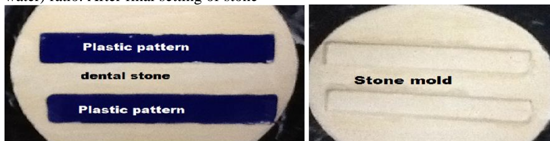
Fig. 2. Mold preparation

material, the plastic patterns were removed carefully (Fig2).