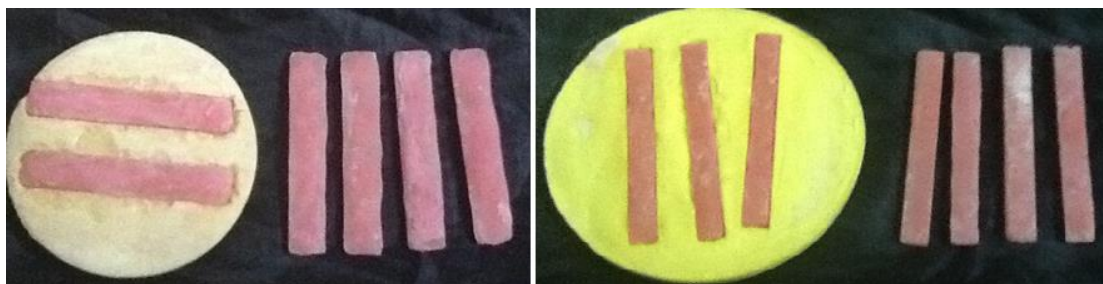
Fig. 3. Cold cure acrylic manipulation

Sprinkle on technique, in which the polymer is saturated by its monomer, the polymer and the monomers were applied alternately until the mold was filled. left to be set in the room temperature(23+ 2°C) for 20 minutes (open to air), after curing, each specimen was retrieved from its respective mold and the excess was trimmed gently with an acrylic bur (Fig3). The accuracy of the dimensions was verified with a digital vernier caliper, at three locations of each dimension to within 0.2 mm tolerance.